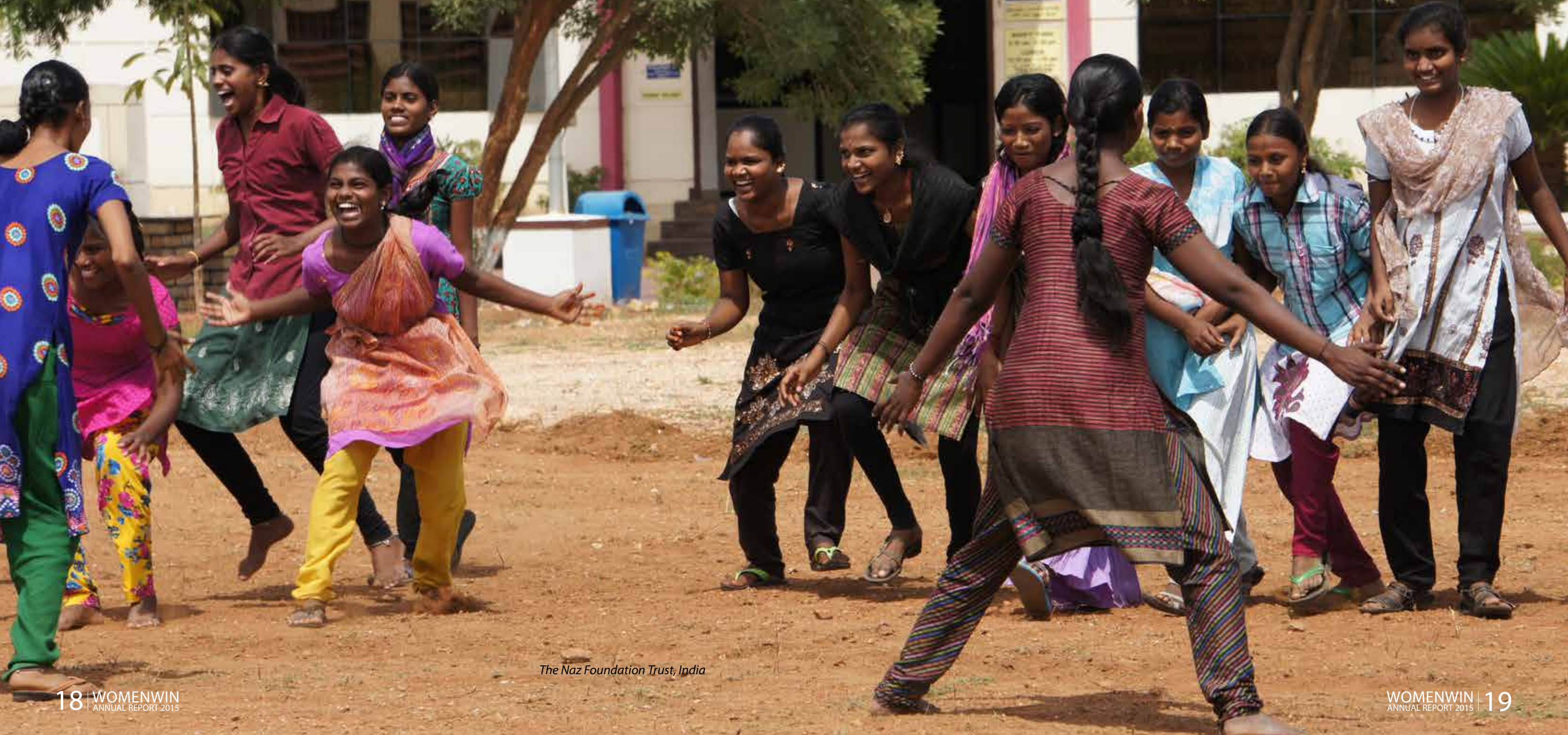
The Naz Foundation Trust, India