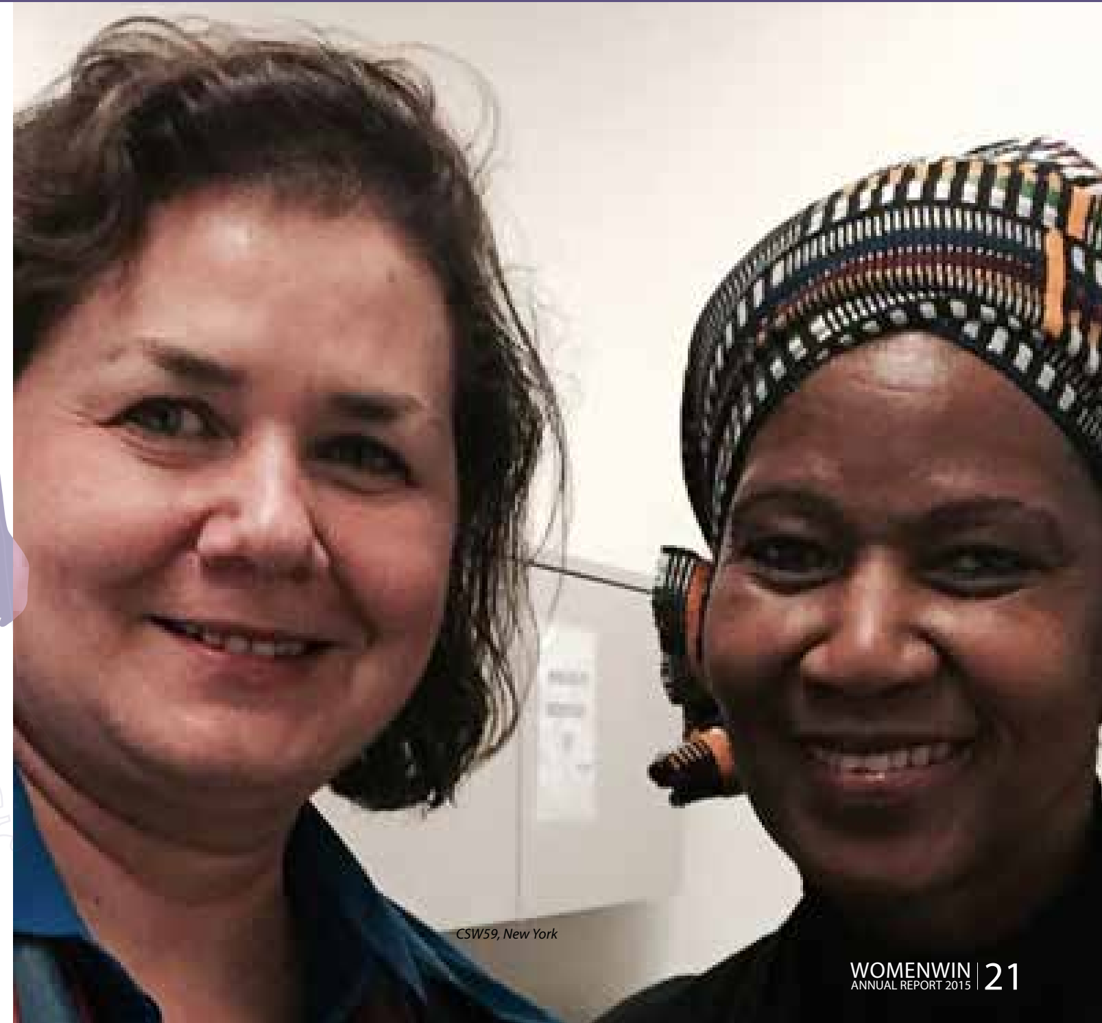
CSW59, New York