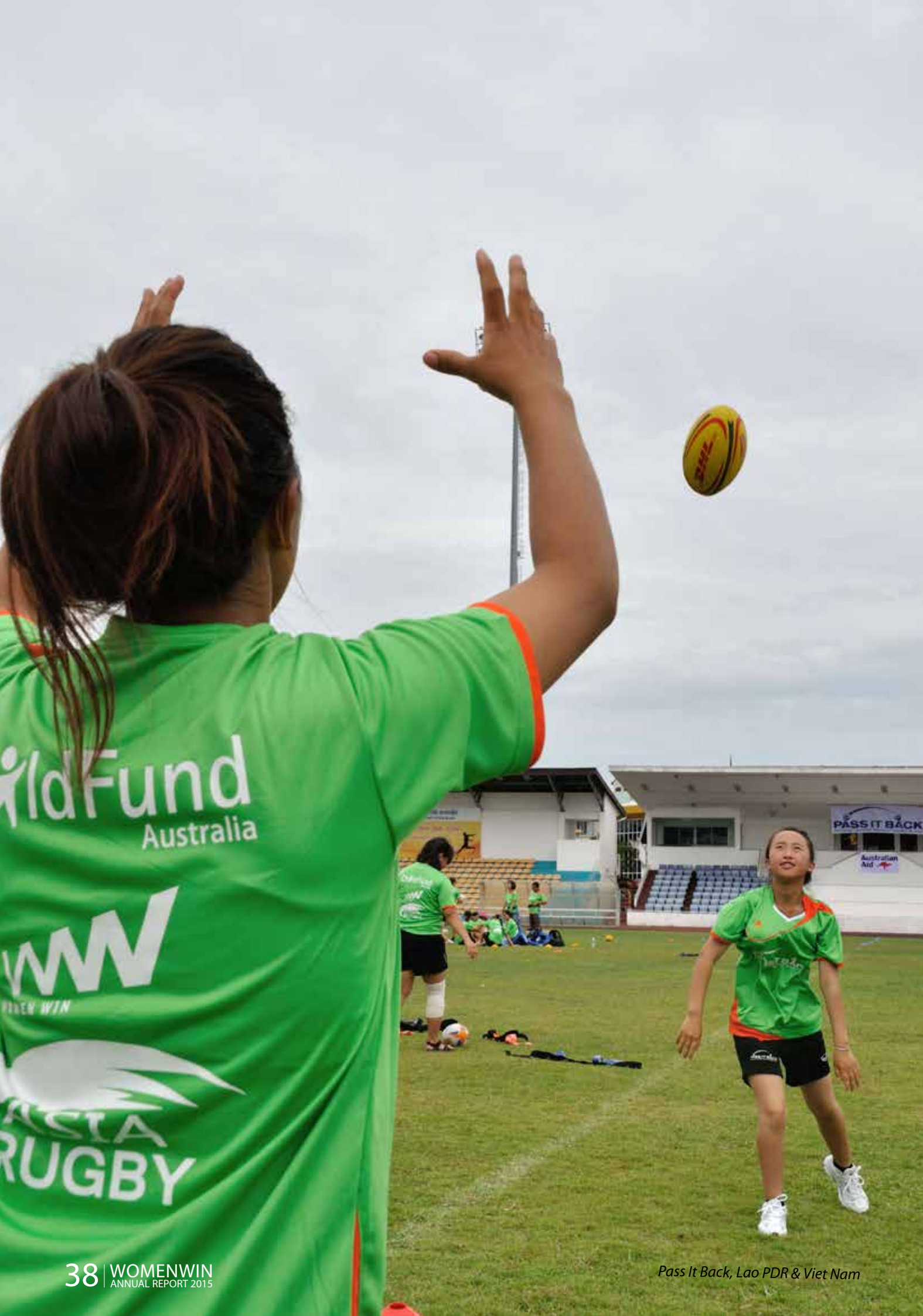
Pass It Back, Lao PDR & Viet Nam