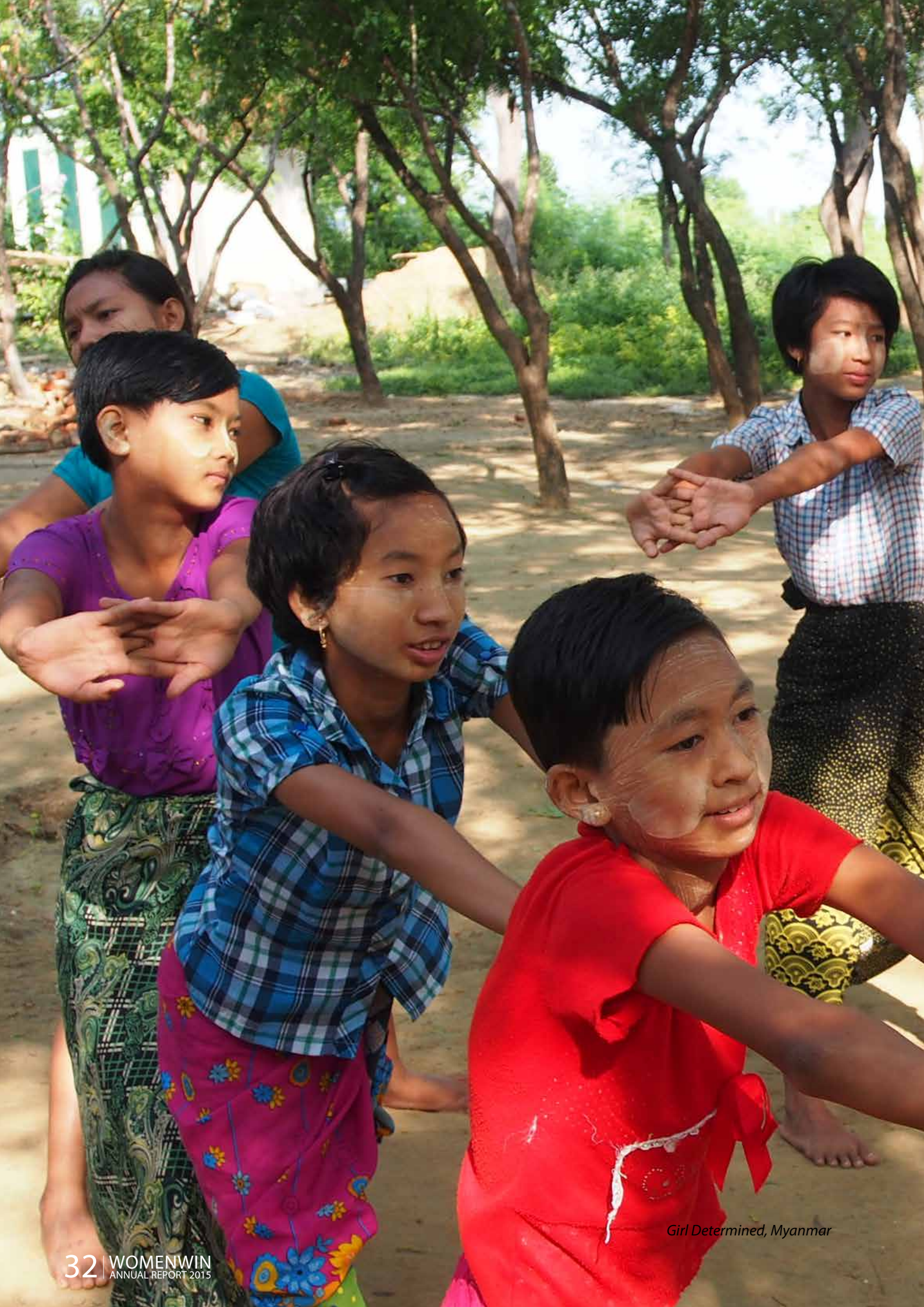
Girl Determined, Myanmar

“Before there were no girl or women leaders and so we didn’t know that our rights were being violated and that we were facing such discrimination. Now we are learning ways to demand and secure our rights, at least at the level of our community. From there it can grow”