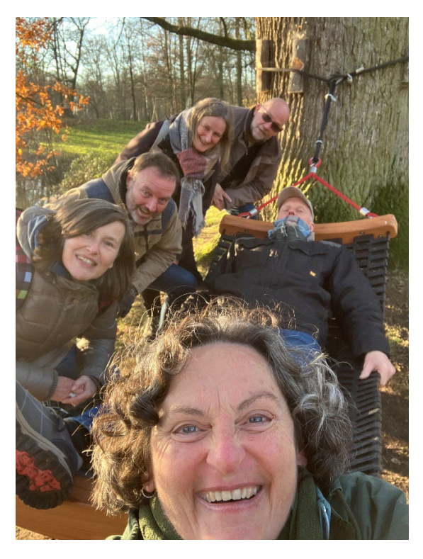
Team Day Out 2024